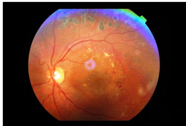
Figure 1. Retina Post Laser Photocoagulation

The frequency doubled Nd:YAG laser emit 532 nm radiation. This is achieved by passing 1064 nm radiation from YAG crystal through a Potassium-Titanyl-Phosphate (KTP) crystal, thereby converting some energy to 532 nm radiation. The YAG crystal maybe pumped by arc light or by a diode laser. Photocoagulation effect is similar to that of continuous wave argon green laser.