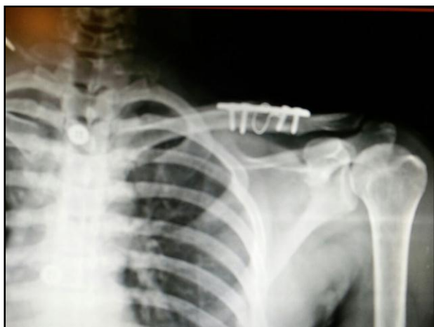
Figure 4. Postoperative X-Ray - Treated with Plate and Screw with Encirclage Wire of the Butterfly Fragment