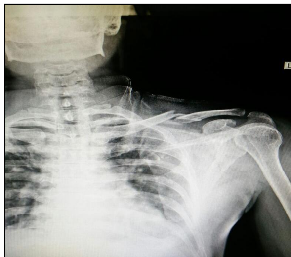
Figure 1. Preoperative X-Ray with Displaced Butterfly Fragment

Clinically, 8 patients complained of mild soreness with weather and activity and 2 patients had impairment in terminal 20 degrees of shoulder movement. These patients were elderly and diabetic; this did not handicap them from their daily activities. Eighteen patients after eight weeks and seven patients after fourteen weeks with radiological union were advised to return to their routine regular activities and were abstained from heavy work. At 24 weeks, they were advised to go back to the preinjury activities.