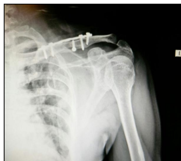
Figure 2. Postoperative X-Ray Treated with Plate and Screw with Interfragmentary Fixation of the Butterfly Fragment