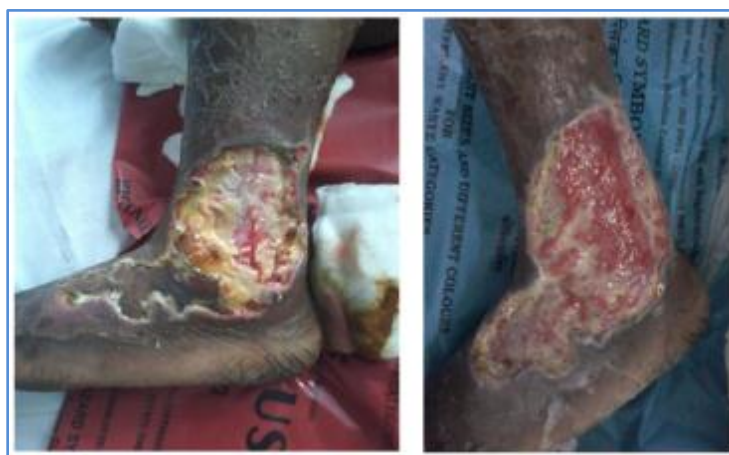
Fig. 4 & 5: Diabetic foot After Conventional dressing