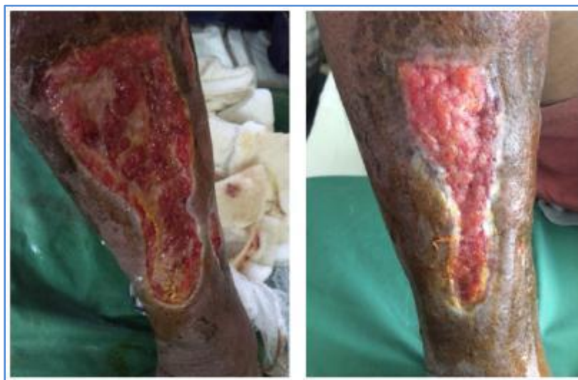
Fig. 2 & 3: Chronic leg ulcer Healing after Manuka honey dressing