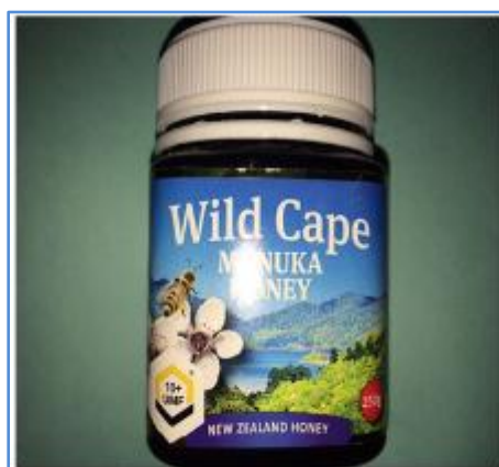
Fig. 1: Manuka honey