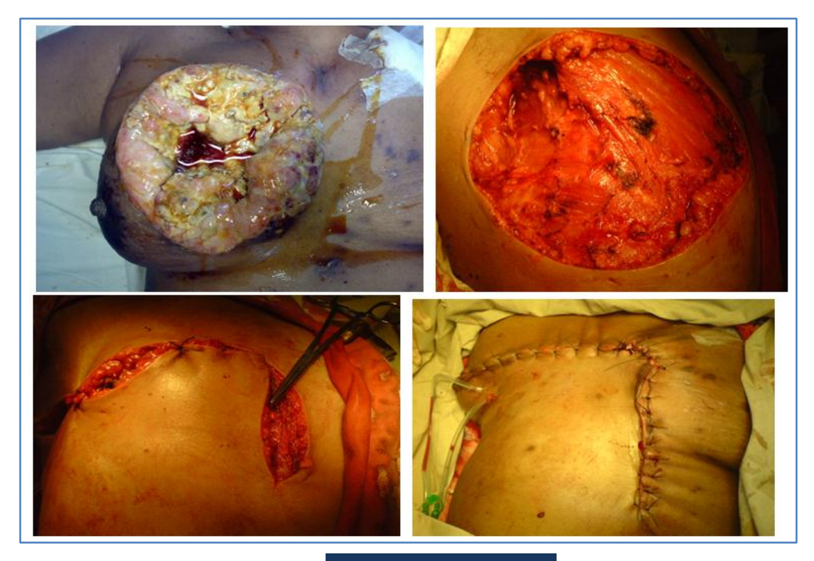
Figure 1, 2, 3 and 4

DISCUSSION: Though the awareness about BC has increased among public in India, LABC is still common. We often see advanced cases with large tumors, ulceration and fungation. Frequent problem in treating such cases is wound closure.