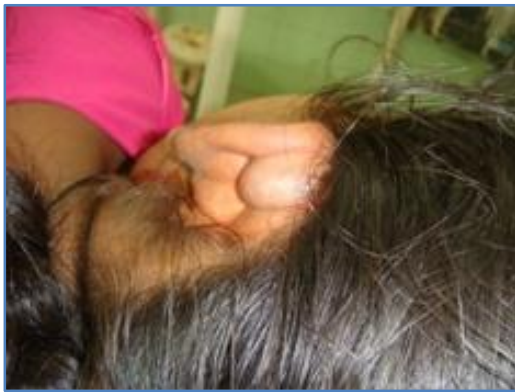
FIG. 4. CASE 2: Venous Malformation of Ear