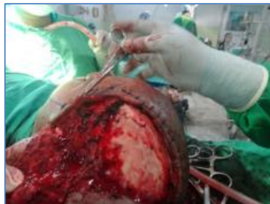
FIG. 8. CASE 3: Intra Op Photograph of the Excision of Venous Malformation of Scalp