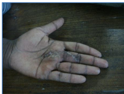
FIG. 3. CASE 1: Post op CVM. Full extension after excision of the lesion