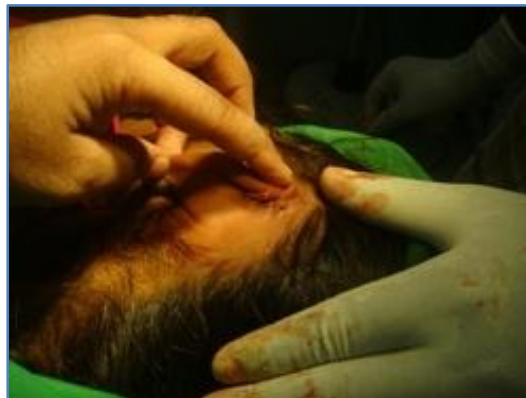
FIG. 6. CASE 2: Post Op Appearance after Excision of the Lesion