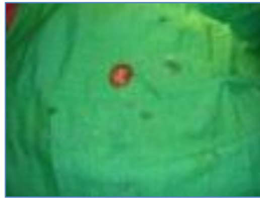
FIG. 5. CASE 2: Excised Mass in TOTO after NBCA administration