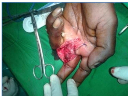
FIG. 1. CASE 1: CVM finger after injection of NBCA