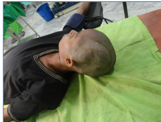
FIG. 7: Venous malformation of scalp