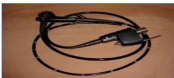
Figure 1. Fujinon 201 F Series Fiber Optic Endoscope