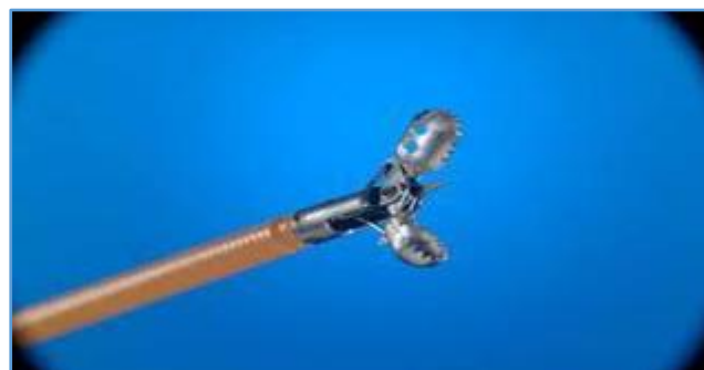
Figure 4. Tips of Endoscopic Biopsy Forceps