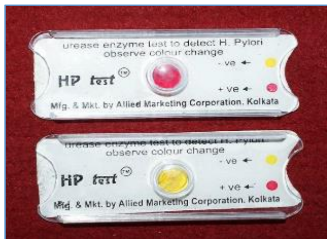
Figure 5. Rapid Urease Test Kit