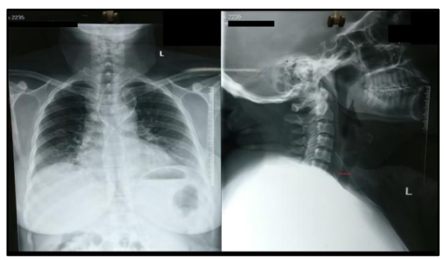
Figure 2. Postoperative CXR showing Relieved Compression of Trachea

At surgery, the upper right and left horn of both lobes were normal. Isthmus and lower part of both lobes were enlarged and going down into anterior mediastinum compressing trachea (Figure 6) anteroposteriorly (size 9*7*3 cm (Figure 3). During surgery, bilateral recurrent laryngeal nerves were identified and preserved. Postoperatively, after extubation, patient developed transient neurapraxia of right vocal cord, which resolved with prednisolone. Patient was discharged on postoperative day 10 in stable condition. Histological examination confirmed colloid adenomatous goitre. On followup, patient was relieved of the compressive symptoms and now could lie down supine without any difficulty.