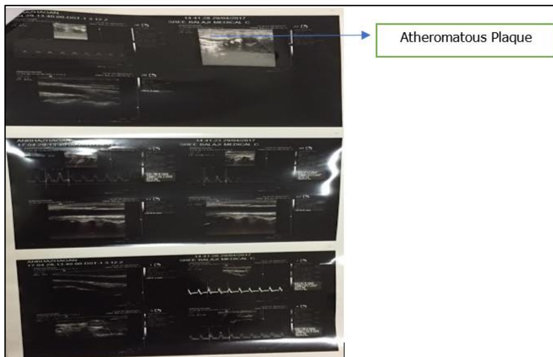
Figure 3. Doppler Showing Occlusion of Right ICA with Atheromatous Plaque