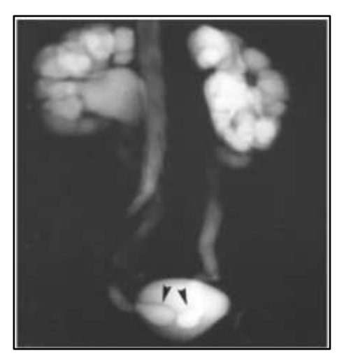
Figure 5. MR Urography of 12 yrs. old male shows bilateral ureterocoeles (arrows) with bilateral moderate hydronephrosis and bilateral mild hydroureters