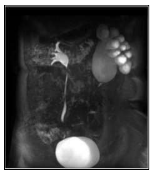
Figure 3. MR Urography image of 15 yrs. old male showing gross hydronephrosis on the left side due to PUJ obstruction (black arrow)