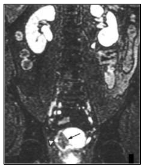
Figure 2. Source MR urogram image of 60 yrs. old male shows huge hypointense filling defect (arrow) in right side of bladder, partially infiltrating VUJ (arrowhead)