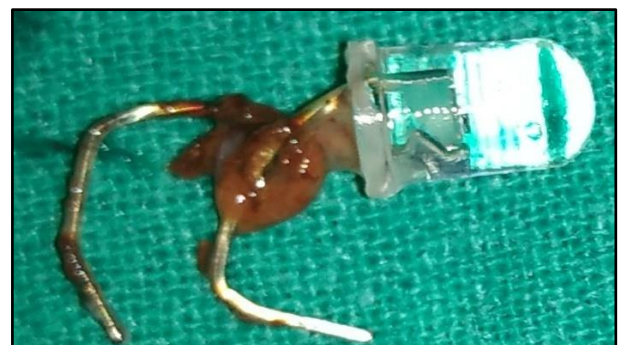
Figure 2. The Extracted LED Bulb

Financial or Other, Competing Interest: None.