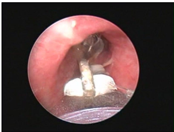
Figure 3. Bronchoscopic Removal of Foreign Body