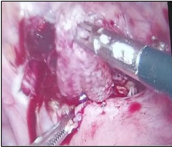
Image 4. Laparoscopic Removal of Gestation Sac with Product of Conception