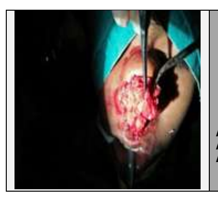
Figure 3. Mass after Dissection