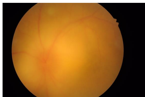
Legend 2. Fundus Photograph Showing Dense Vitritis, Choroiditis and Optic Neuritis