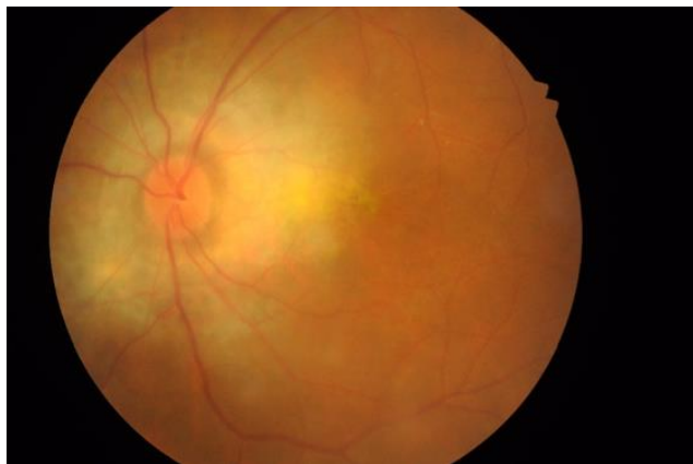
Legend 4. Resolved Vitritis, Optic Neuritis & Posterior Uveitis