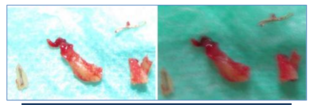
Fig. 3: Surgical – after removal of fractured segments with periapical granuloma at the apex of the mesial root

Fig. 2: Surgical view- full thickness flap raised, vertical fracture line in the mesial root of 46 extending from CEJ to the apex, bone loss seen around the same