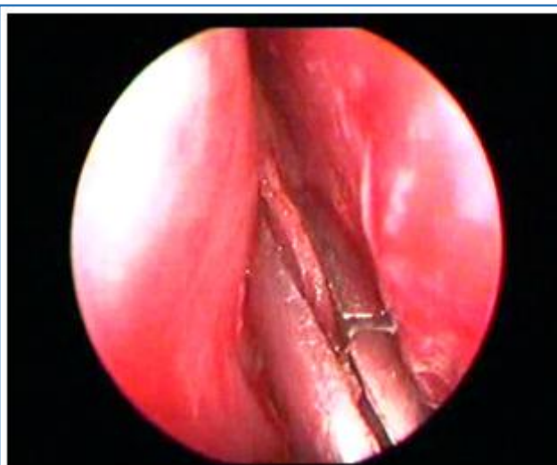
Fig. 3: Deviated portion excised

Deviated portions of bone from vomer and the perpendicular plate of ethmoid are removed if required (Figure 3). Maxillary crest is chiselled if required.