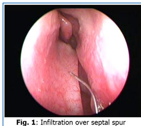
Fig. 1: Infiltration over septal spur

Before operation both the nasal cavities were packed with ribbon gauge soaked in 4% Xylocaine and 1:100000 2% Xylocaine with adrenaline was infiltrated (Figure 1). The author typically uses Freer or Killian's incision on left side irrespective of the side of deviation.