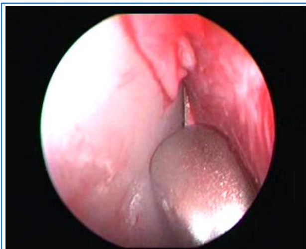
Fig. 2: Mucoperichondrial flap elevation

In selective cases where spurs were sharp open book method was used. [5] Under direct visualisation using a 0° endoscope, mucoperichondrial flaps are elevated with suction elevator to expose the deviated portion of the septum (Figure 2).