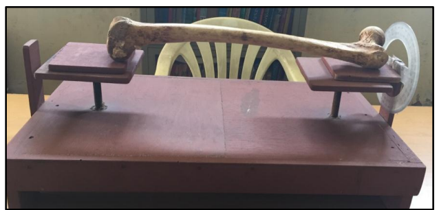
Figure 2. Osteometric Table