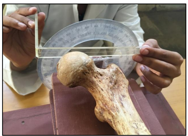
Figure 3. Measurement of the FNA using Fibre Plate