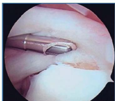
Fig. 1: Glenoid preparation