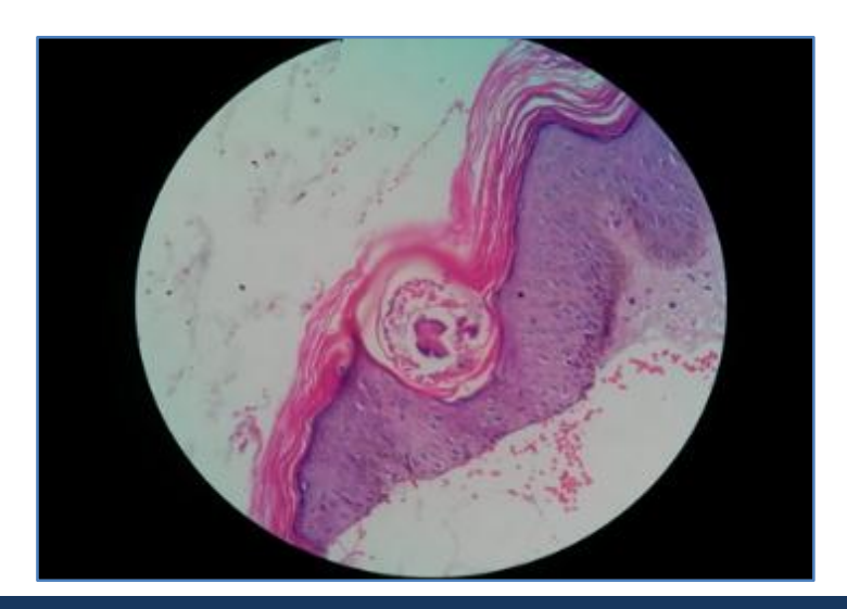
Fragments of mite and scabals are seen within the stratum corneum and superficial dermis shows perivascular infiltration by lymphocytes and eosinophils