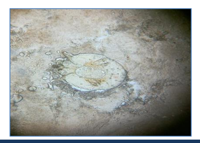
Adult female mite found in the skin scrapings