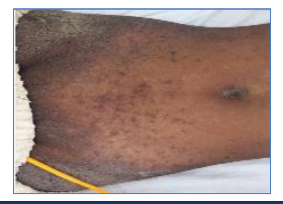
Crusted plaques and papules seen in and around the Umbilicus (Peri umbilical region) and in the pelvic