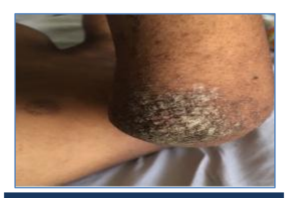
Hyperkeratotic crusted lesion over the extensor aspect of left elbow