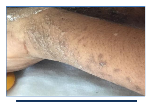
Scaly plagues over the wrist