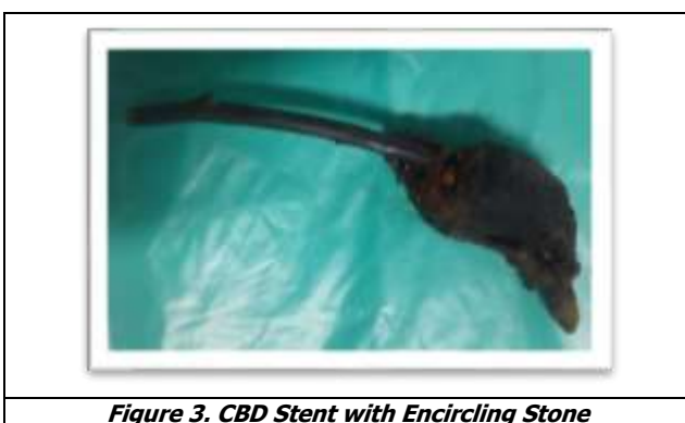
Figure 3. CBD Stent with Encircling Stone

After manipulation with adequate care and dissection, the stone along with the stent in toto was then removed completely. Choledochoscopy was done for confirmation. Thorough wash was given to the common bile duct to clear the sludge and the entire proximal and distal duct was irrigated and cleared with saline and Cholecystectomy done. The procedure was then completed by doing a choledochoduodenostomy with diamond shaped anastomosis. Haemostasis was achieved and the abdomen was closed in layers after placement of an abdominal drain.