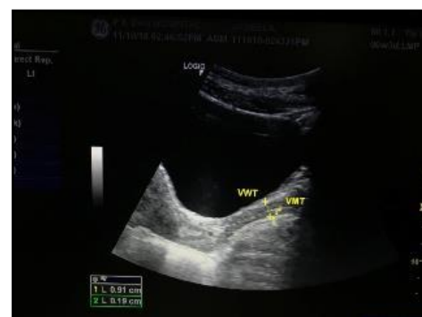
Figure 1. Depicts the Measurements Technique of VMT and VWT

Vaginal wall thickness assessment was done in compliance to the technique described by Balica A. et al 3 in which, coronal USG imaging at the level of ureteric orifices was done after visualization of the ureteric jets via Colour Doppler. (Figure 2 and Figure 3). Then, sagittal section at the desired midpoint between the levels of bilateral ureteric orifices was obtained following which, the radiologist measures vaginal wall parameters using GE Logic F8 system and a 2-5 MHz curvilinear abdominal probe.