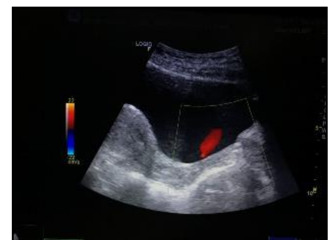
Figure 2. Shows the Level of Ureteric Jet of Urine as on Colour Doppler Imaging