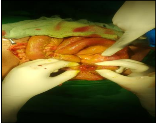
Figure 2. Single Perforation on Proximal Ileum