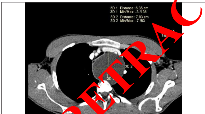
Figure 2. Contrast Enhanced Computerized Tomogra phy (CECT) of thorax.