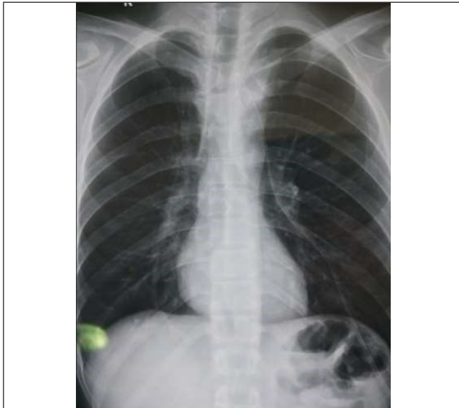
Figure 6. Chest X-Ray after removing International Classification of Diseases (ICD).

The drain output slowly decreased to 100 ml over 15 days. The drain accidentally came out on POD 16. Pressure bandage of that area was done in Figure 7.