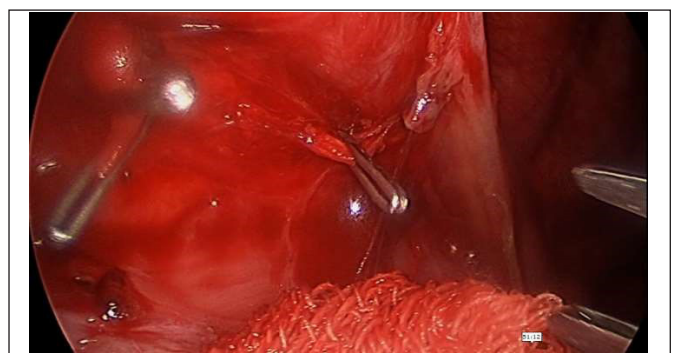
Figure 5. Thoracic duct ligation via Video-Assisted Thoracoscopic Surgery (VATS).

Patient was given 80 ml butter milk through Ryles tube after intubation 20 mins before starting the surgery and the thoracic duct was identified as a yellowish white structure which was clipped and cut. Right sided ICD was inserted. Patient was kept NPO. Medium chain fatty feed through Ryles tube was started with total parenteral nutrition and injection octreotide 100 mg s/c every 8 hours. ICD removed on POD 5 (Figure 6).