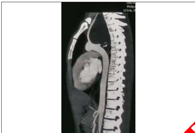
Figure 1. Cystic lesion in left para and retro tracheal.

He was working as an electrician in Dubai. During his stay in Dubai, he developed shortness of breath which was on exertion initially, later worsened over duration of 3 years to pose difficulty in sleeping in supine position forcing him to sleep in lateral decubitus position only. He occasional had dry cough with no history of any chest pain or any history of any upper limb weakness, paresthesia's or coldness. On examination there was no obvious swelling in the neck. His breath holding time was 39 seconds. Biochemical routine lab parameters and thyroid function test were normal. X-Ray neck lateral view in extension position showed slightly compressed trachea. Contrast Enhanced Computerized Tomography (CECT) thorax showed a 7 cm × 6.35 cm × 5.6 cm sized well defined thin walled, rounded, non-enhancing cystic lesion in left para and retro tracheal region in superior and middle zediastinum (Figures 1,2 and 3).