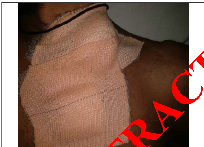
Figure 7. Pressure bandage after accidental drain removal.

The drain output slowly decreased to 100 ml over 15 days. The drain accidentally came out on POD 16. Pressure bandage of that area was done in Figure 7.