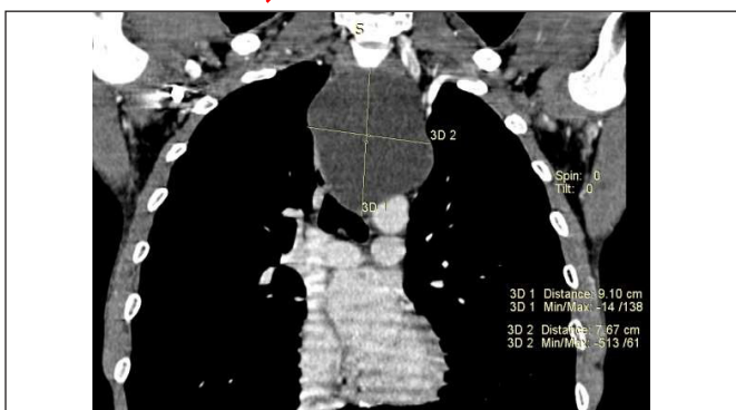
Figure 3. X-Ray neck lateral view in extension position showed slightly compressed trachea.