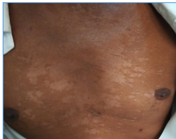
Figure 1. Shows the Skin Lesions of Pityriasis Versicolor Over the Chest in a Patient of this Study