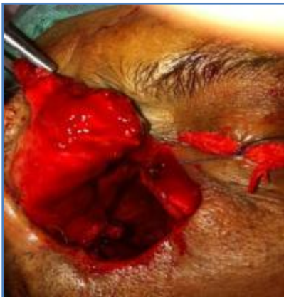
Fig. 3: Lateral rhinotomy approach