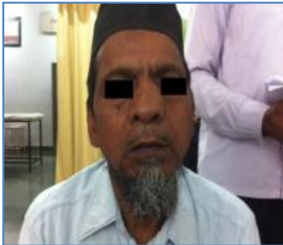
Fig. 1: Left nasal swelling

After 1 months of surgery, the patient was asymptomatic and attending outpatient follow-up. So far, he has not showed evidences of relapses.