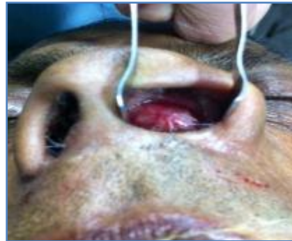
Fig. 2: Left nasal mass