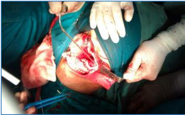
Fig. 3: Intraoperative Picture of Exposure of Tumour in the Left Maxillary Sinus

DISCUSSION: Plasma cells are mature immunocompetent cells derived from B lymphocytes and provide humoral immunity within the immune system. They produce specific antibodies against specific antigens in different tissues. Plasmacytomas are discrete, solitary mass of neoplastic monoclonal plasma cells in either bone or soft tissue (extramedullary). The commonest immunoglobulin expressed by the tumour cells is IgG. They differ from multiple myeloma in that though they have identical plasma cells similar to multiple myeloma, they do not present with systemic involvement.