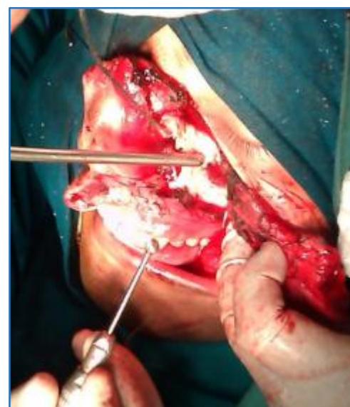
Fig. 2: Intraoperative Picture Showing Tumour Eroding the Anterior Wall of the Maxillary Sinus and Nasal Cavity