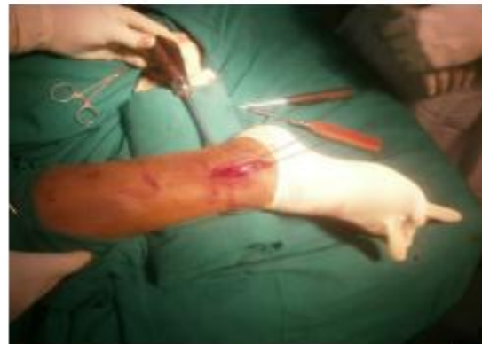
Fig. 4. Fixed with 2 k-wires