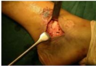
Fig. 7: Exposure of fracture site