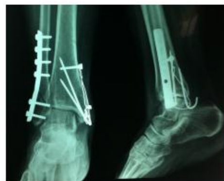
Fig 12 .4 weeks postoperative xray