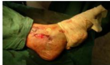
Fig 8. Fixation with CC screws