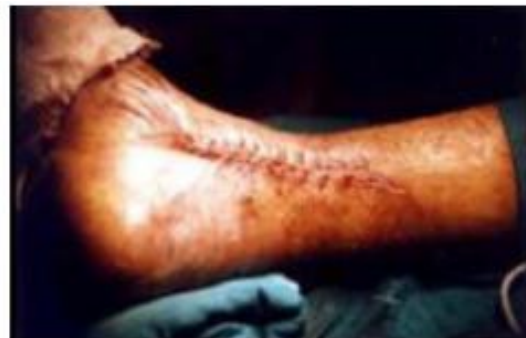
Fig: 6. Skin Closure