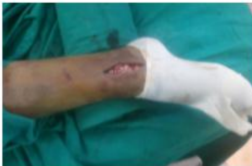
Fig. 5: Tension band wiring