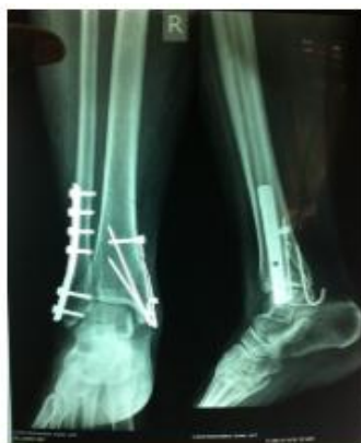
Fig 13. 1yr follow up xray

CONCLUSION: In or present study of 20 patients with ankle fractures that were unstable, displaced or both treated surgically by Open reduction and internal fixation in accordance with AO principles. Understanding the mechanism of injury is essential for good reduction and internal fixation. The bend of the lateral malleolus should be reproduced when the plate is being used and also the fibular length has to be maintained for lateral stability of the ankle. Anatomical reduction is essential in all intra articular fractures more so for a weight bearing joint like ankle. Open reduction and internal fixation will ensure high standard of reduction besides eliminating the chances of loss of reduction since the operative results were satisfactory in 90% of patients. The results in our series confirm as have those of other series that Open reduction and Internal fixation is the treatment of choice for unstable and displaced malleolar fractures.