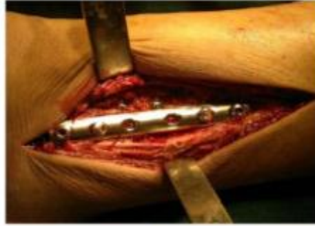
Fig. 2: ORIF with Semi-tubular plate