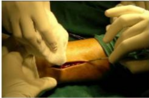
Fig. 1: Incision for lateral malleolus