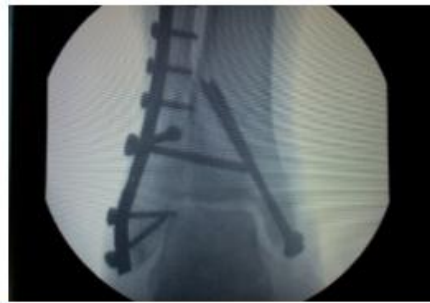
Fig 10. Per operative c-arm image

RESULTS AND ANALYSIS: All the fractures were followed until fracture union occurred. Results were analysed both clinically and radio graphically. All most all fractures united at the end of 10 weeks. Functional and radiological results were analyzed using the ankle scoring system of Biard and Jackson. 3