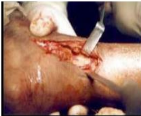
Fig. 3: Exposure of the fracture site