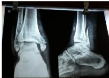
Fig. 9: Pre op unstable trimalleolar