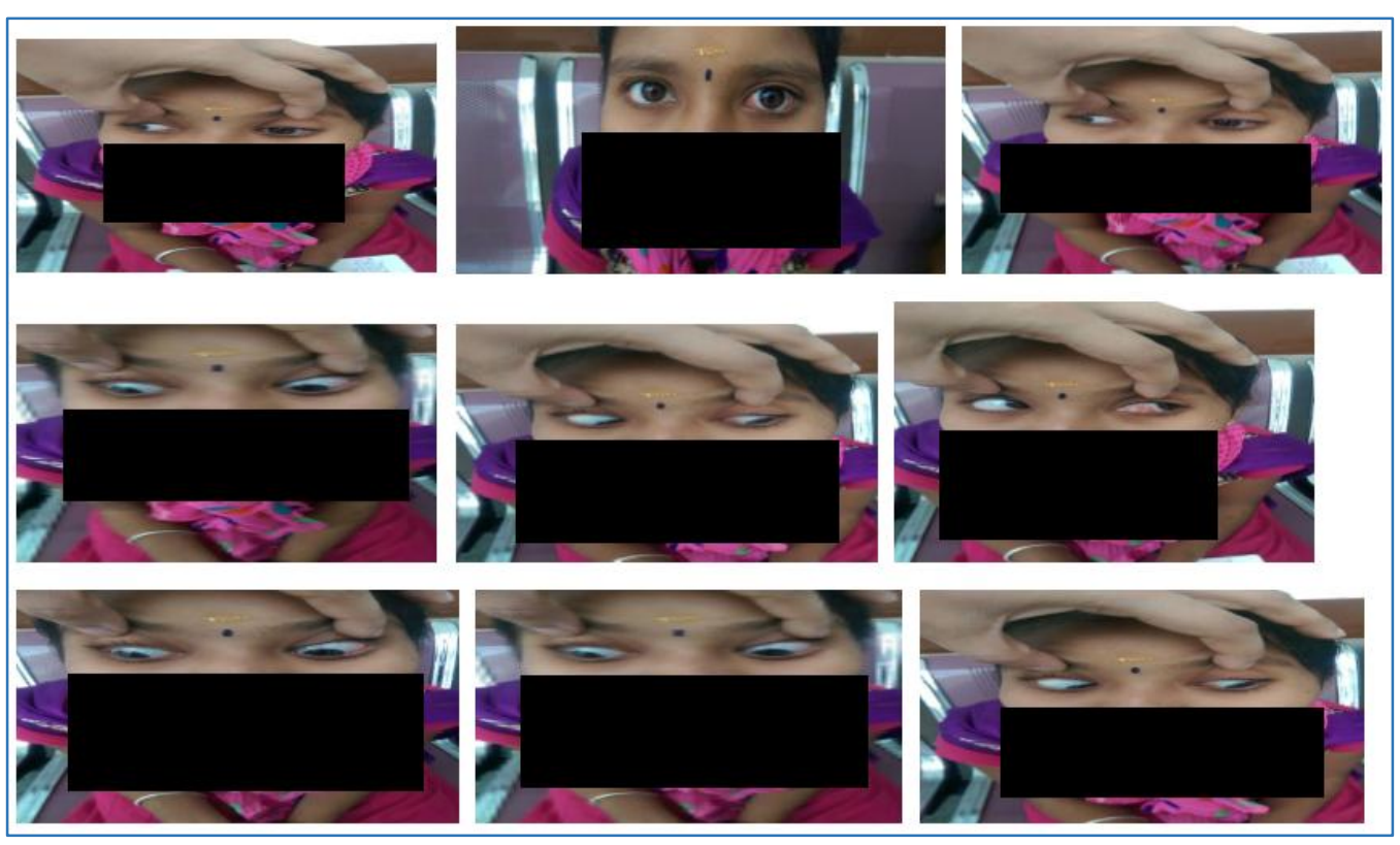
Fig. 3: Post-Operative Photos of Infantile Esotropia

DISCUSSION: Strabismus is misalignment of visual axes of two eyes. Broadly it can be classified as1) Apparent squint or pseudo strabismus. 2) latent squint 3) Manifest squint (heterophoria) - a) concomitant squint b) incomitant squint. Infantile esotropia is one of the concomitant squint and also the most common type of infantile strabismus. Congenital esotropia is a misnomer as esotropia is not present at birth and presents within six months of age. Genetic component plays a major role. Other factors associated are prematurity, instrumental delivery, use of supplemental oxygen, hydrocephalus, developmental delay, seizure disorders, intraventricular haemorrhage.