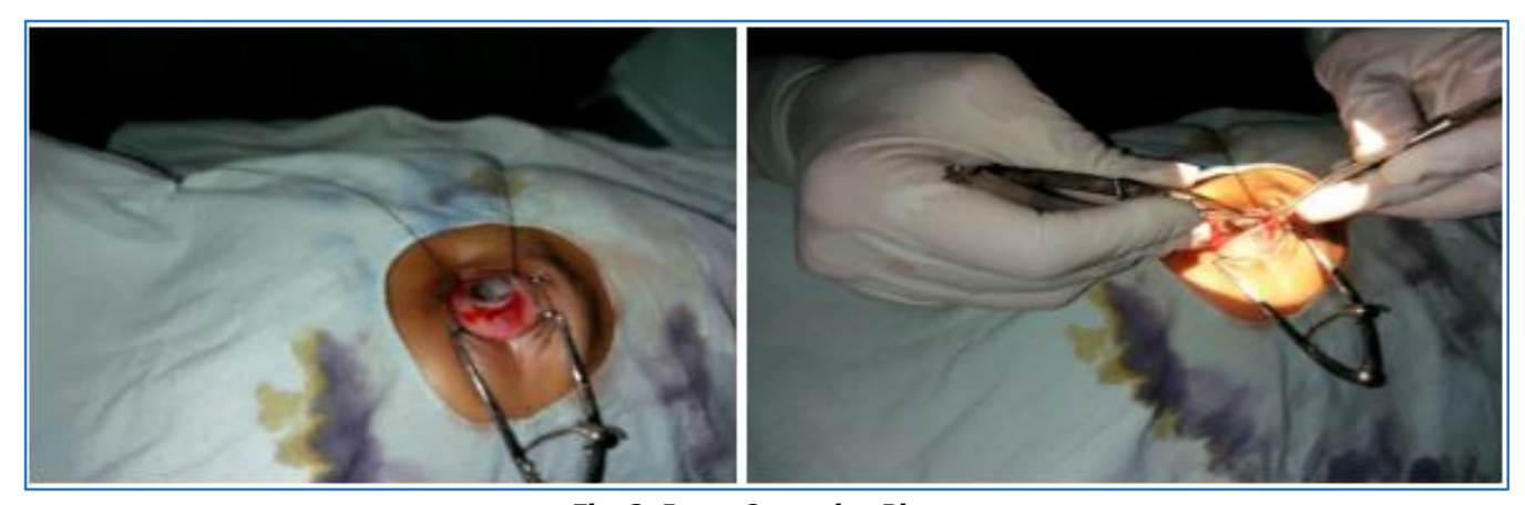
Fig. 2: Intra-Operative Photos